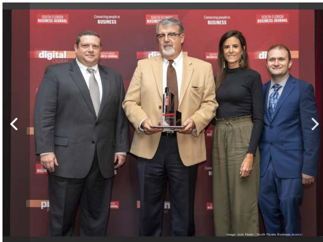
Ofizzina by TSG Group and BF Group, winner of the Best Office / R&D / Reuse / Rehab category.