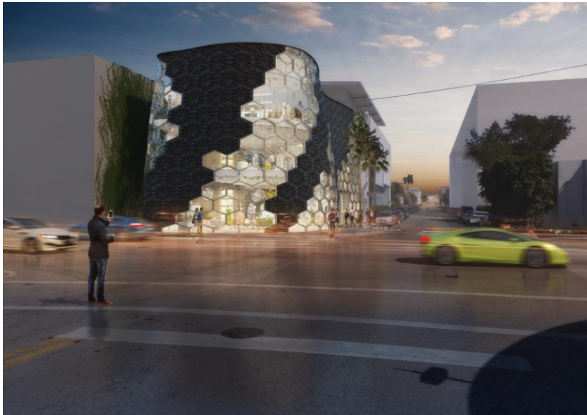
DD41 is a 5,100-square-foot commercial development site in the Miami Design District at 15 N.E. 41st St. While preliminary plans have been drawn up, the landlord is willing to accommodate buildout for whatever tenant preleases the space.